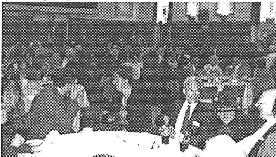
THIS PHOTOGRAPH DOESN'T SHOW EVERYBODY AND A FULL LIST OF ATTENDEES IS GIVEN ON THE NEXT PAGE