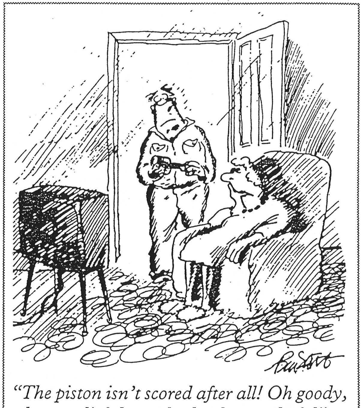
what a relief, how absolutely wonderful"

DON'T EXPECT EVERYBODY ELSE TO SHOW THE SAME ENTHUSIASM