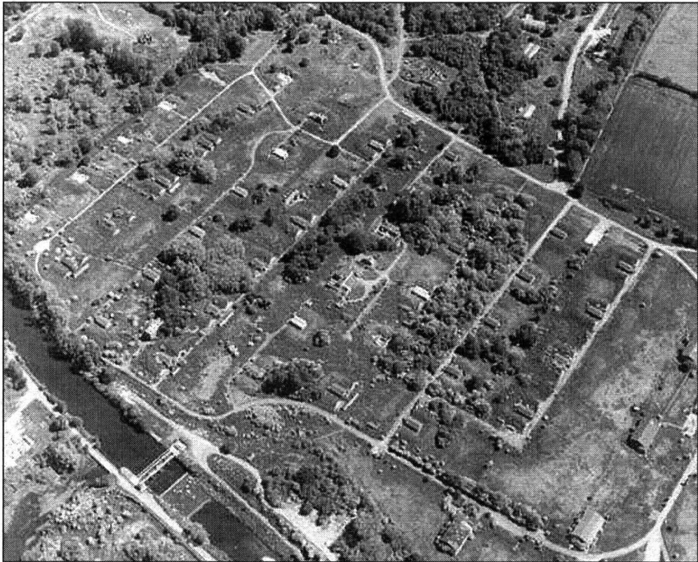
An aerial photograph of the south site, constructed during the 1880s. The buildings are widely spaced to prevent fire spreading in the event of an explosion