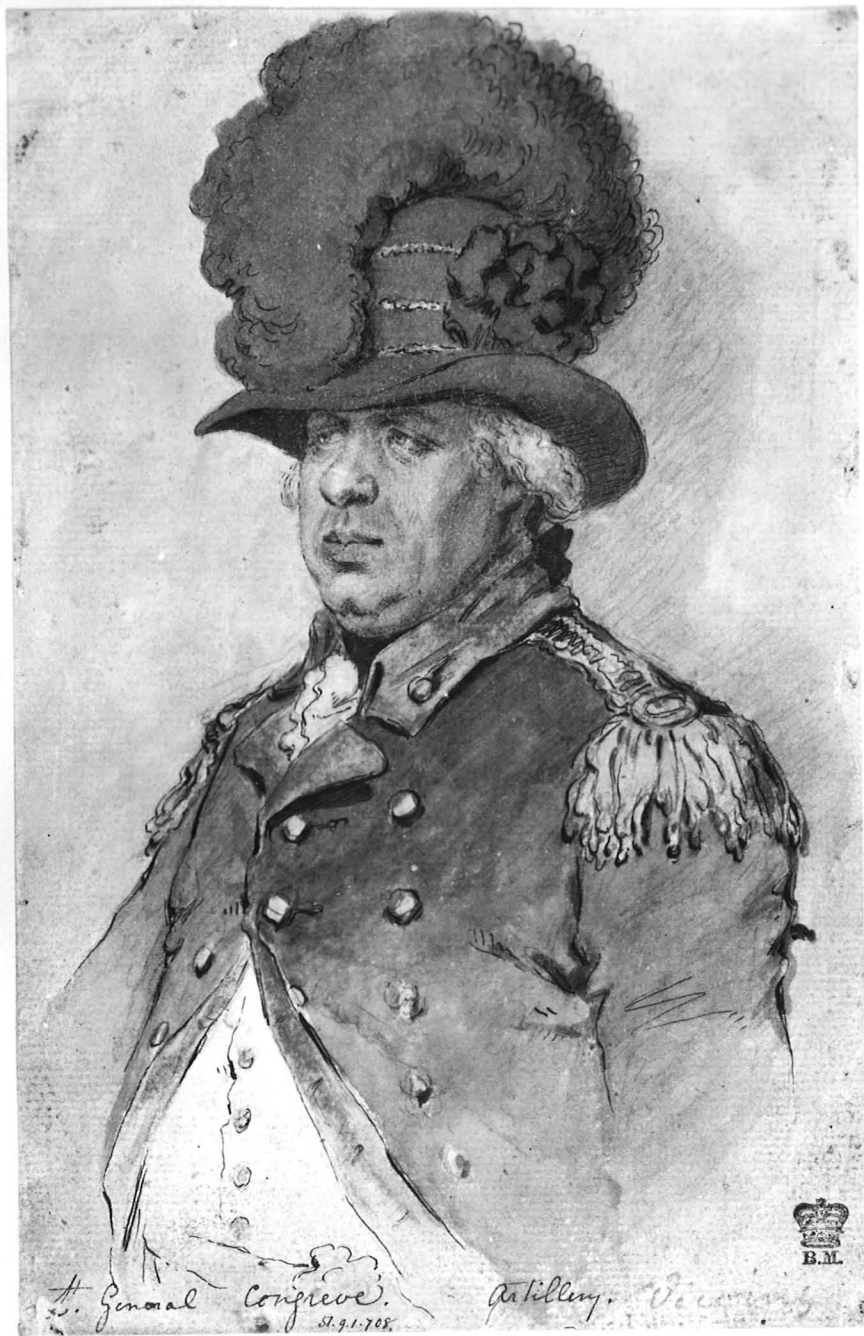
LIEUT. GENERAL SIR WILLIAM CONGREVE.