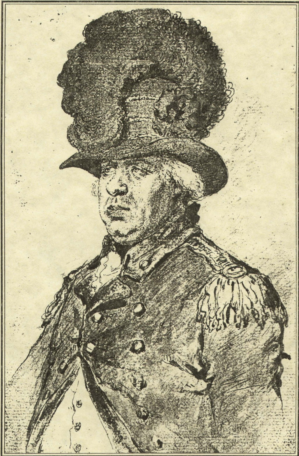
Lt. General Sir William Congreve Controller of the Powder Mills in 1787