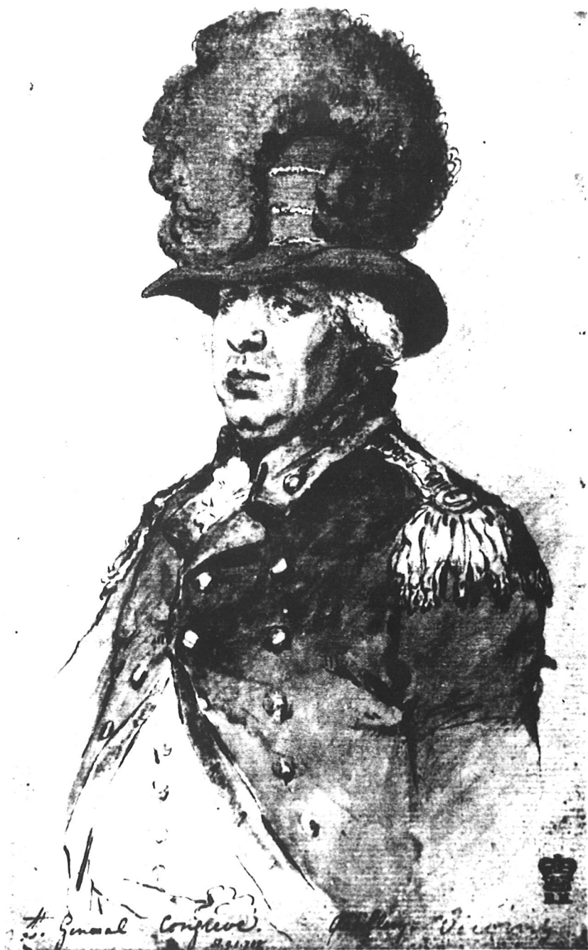
'Lt. Gen. Sir William Congreve'

B.M. 1851.9.1.708 8 x 5: 203 x 128 Water-colour