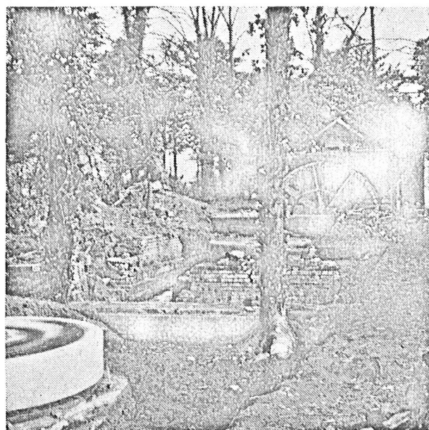
Site after preliminary clearance work 1967